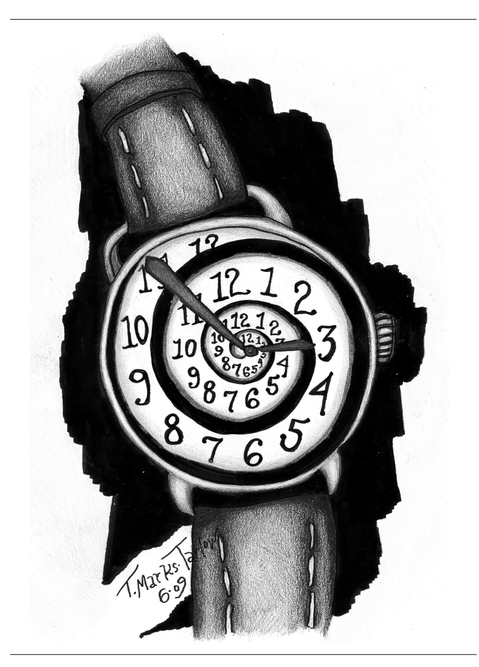
Figure 3. Fractal Watch with Fibonacci sequence by Terry Marks-Tarlow

countertransference issues involves recognizing their presence so we can bracket them aside. The point is not to get rid of our issues entirely. This